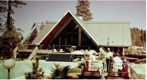
Lake Arrowhead Country Club (c. 1961)

An Audacious Modernism—Saturday, July 17, 2021; 1-2:30 PM PST; $5; go to www.sahscc.org and pay via PayPal or mail in order form on Page 6 with check; Zoom connection information sent upon registration.