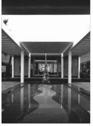
Eldorado Country Club Clubhouse (1959)

Master of the Midcentury—Saturday, September 11, 2021; 1-2:30 PM PST; $5; go to <u>www.sahscc.org</u> and pay via PayPal or mail in order form on Page 6 with check; Zoom connection information sent upon registration.