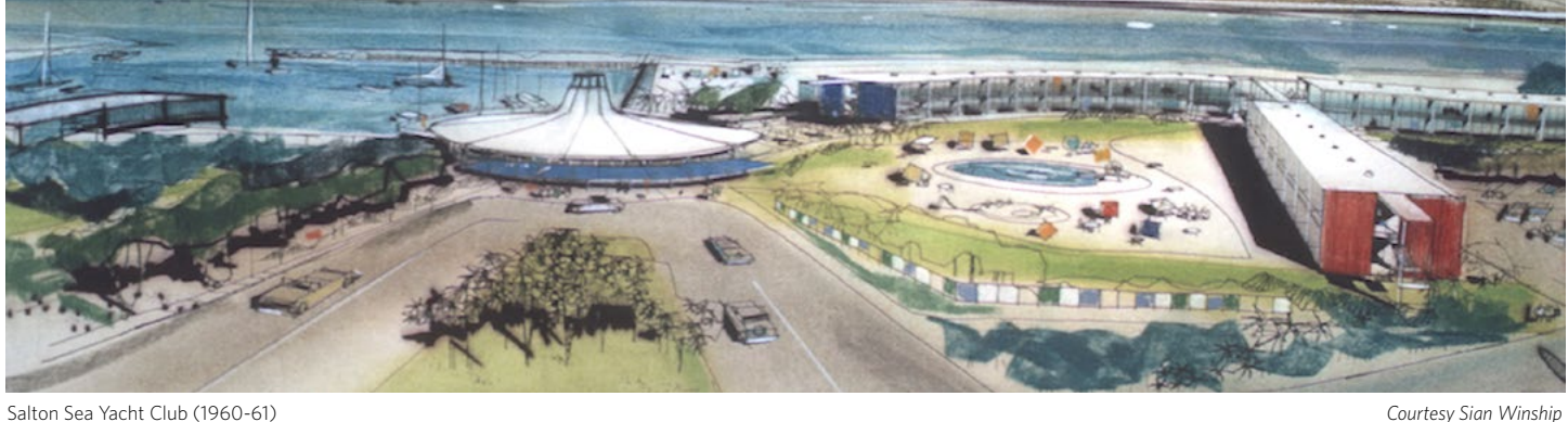
Salton Sea Yacht Club (1960-61)

Saturday, July 17, 2021, 1-2:30 PM Pacific Time