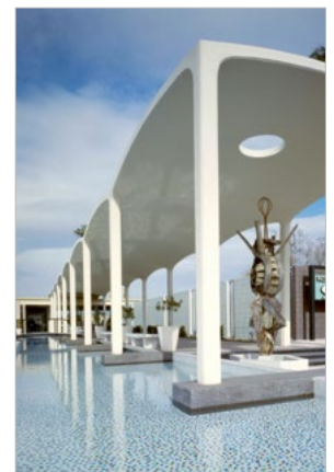
Palm Springs Spa (1959)