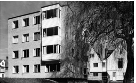
Jesus College Student Housing (1963)