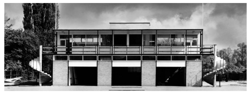
Corpus Christi College and Sidney Sussex College Boathouse (1957).