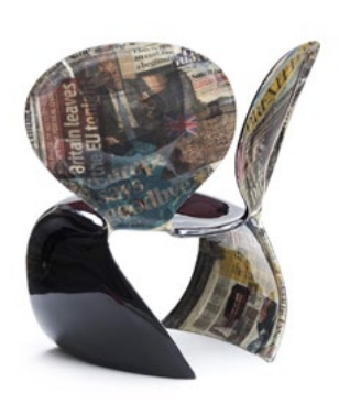
Ron Arad's DFWTM exhibition that was to be at LA's OTI Gallery is now online in the Virtual Design Festival.

A Changing Climate for Preservation, California Preservation Foundation's aptly named annual conference, goes online May 18-20 (with recordings available for registrants). Panels are organized into five tracks: Resilient Planning and Design, Intangible Cultural Heritage, How Preservation Helps Main Street, Rural and Agricultural Heritage in California, and Infill and Affordable Housing.