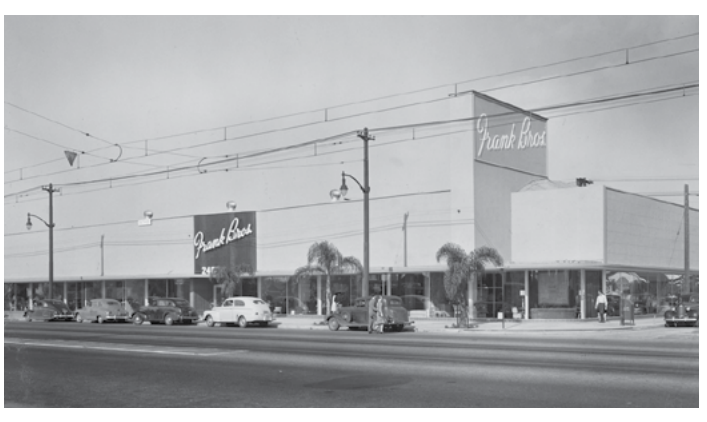
Frank Bros. Exterior, 1947

Frank Bros.—Sunday, February 26, 2017; 10AM-Noon; University Art Museum, California State University, Long Beach; 1250 Bellflower Blvd., Long Beach; $20 for members (limit: two tickets at member price); $25 for non-members; on-campus parking is $7 per car; see order form on Page 6, call 800.972.4722, email info@sahscc.org, or go to www.sahscc.org.