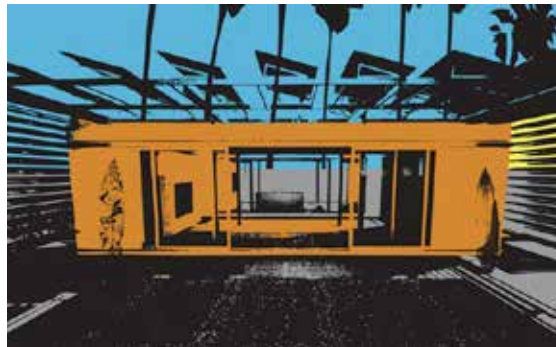
SCI-Arc and California Institute of Technology's Solar Decathlon 2013 House Rendering.