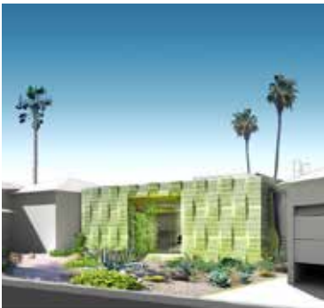
USC's Solar Decathlon 2013 House Rendering.

Houses in the Sun—Solar Decathlon: October 12, 2013; time and price TBD; watch your e-mail for info; reservations required; space is limited; tickets available on a first-come first-served basis.