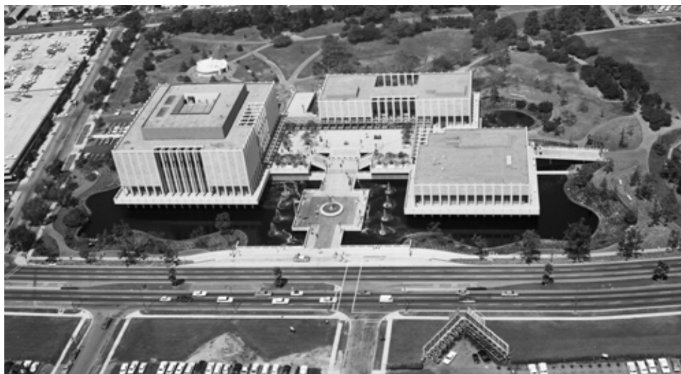
William L. Pereira and Associates' Los Angeles County Museum of Art the year it opened, 1965.