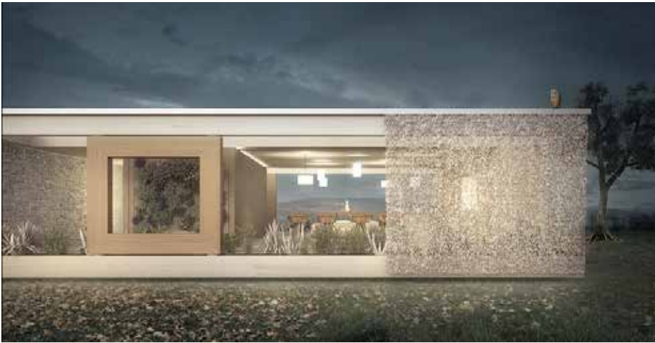
Vienna University of Technology's Solar Decathlon 2013 House Rendering.