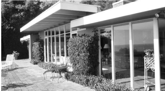
Case Study House #18.

Mark your new 2006 calendar now for our day-long tour of this Case Study House architect's finest residential work in the hills above Los Angeles.