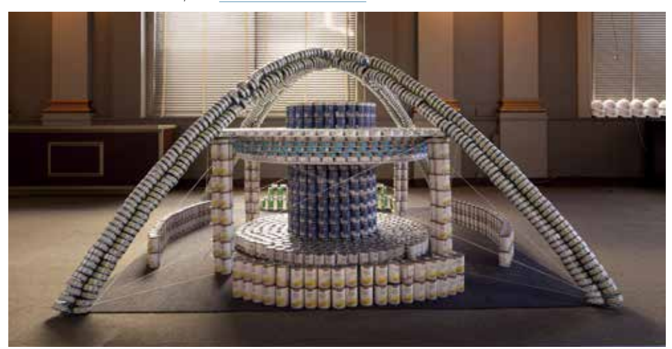
The LAX EnCANter Restaurant by RBB.

Canstruction LA is organized by the Society for Design Administration, and is hosted by Gilmore Properties. Elite sponsors are Herman Miller and Skanska; Platinum sponsor is Milliken; Gold sponsors are Tom Bonner Photography and Dragonfly Design Group; Media sponsor is Los Angeles Downtown News. For more information, visit www.canstructionla.com or call 213.924.8661.