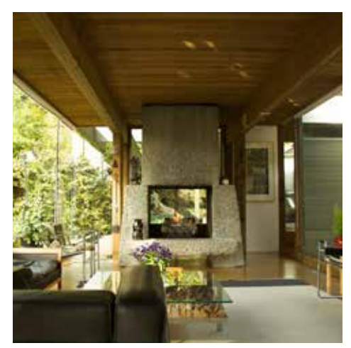
The Smith House by Erickson/Massey Architects (1965) is visited in "Coast Modern."

Tickets are $9 to $14 and are available at The Los Angeles Theatre Center Box Office (514 S. Spring Street) and online. For more info: www.adfilmfest.com; 212.579.3850.