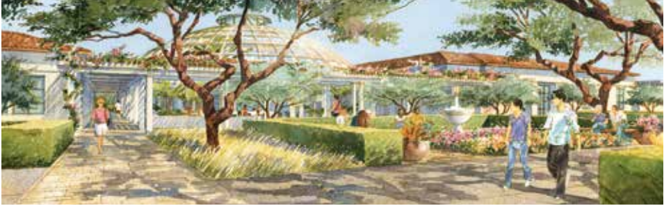
The Garden Court through the Central Garden of the new Education and Visitor Center.

and manuscripts from Chaucer, Shakespeare, and Thoreau, as well as new audio and interactive components that engage visitors to better connect them to history and literature.