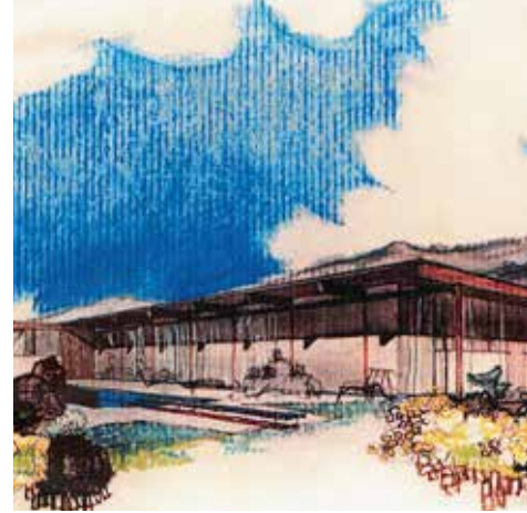
The Oyler House by Richard Neutra from the film of the same name