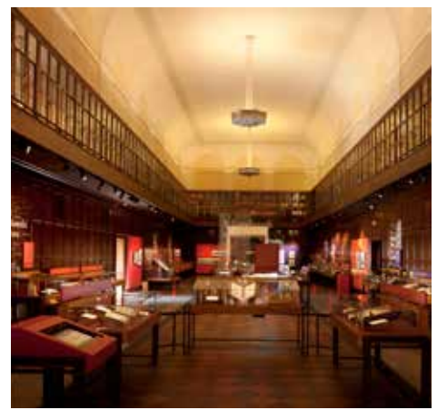
The renovated Library Main Exhibition Hall.