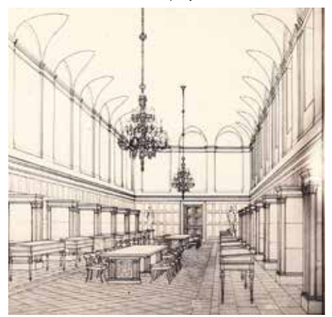
Hunt's drawing of the Library Main Exhibition Hall, ca. 1918.

Tour participants will be guided through a discussion that showcases the Hall's original design elements, its evolution through the decades, and the recent transformation. The tour also includes displays of rare books