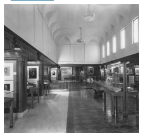
The Hall upon opening, ca. 1920.

The Huntington: The Library Exhibition Hall Illuminated—April 6, 2014; 10:30AM-12:30PM; $35 for SAH/SCC members; $45 for non-members; reservations required; space is limited; reservations are taken on a first-come first-served basis; registration—see order form on Page 6, call 800.972.4722, or go to www.sahscc.org.