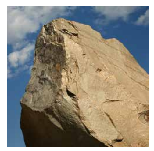
"Levitated Mass" at LACMA.