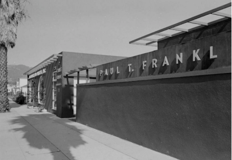
The Rodeo Drive home of Frankl Galleries, c. 1940.