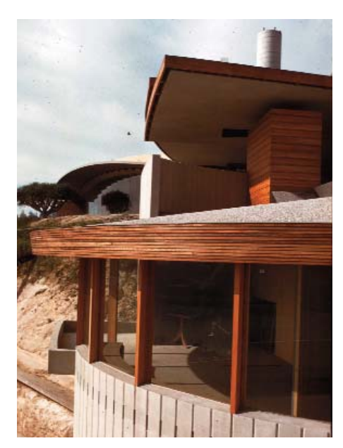
Silvertop Residence (1967).