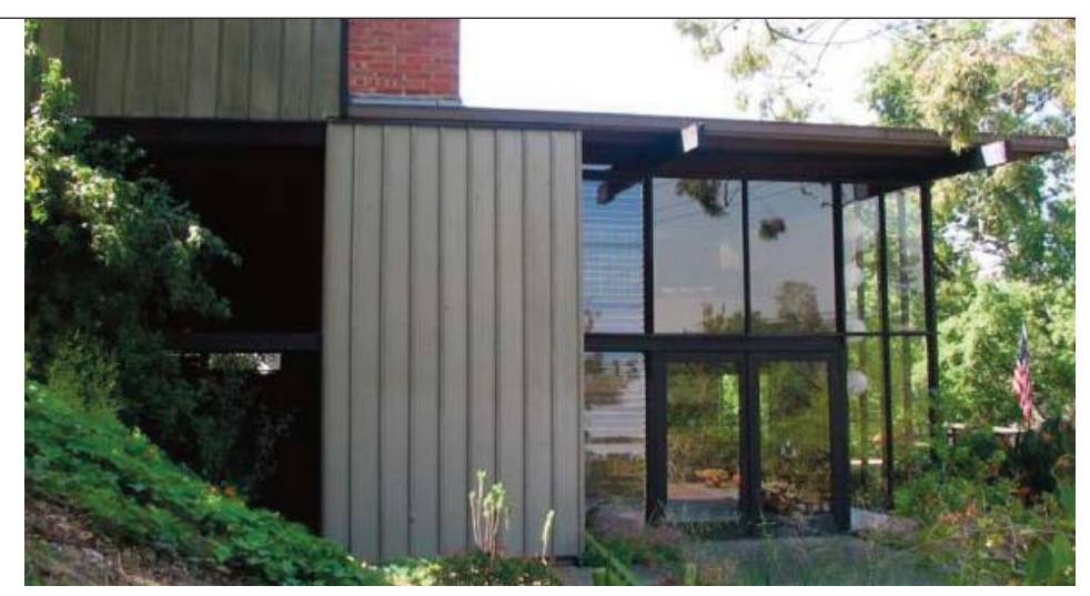
The Wirick House today.

The residence is now a contributor to the Poppy Peak Historic District, which was listed in the National Register of Historic Places just last year. The hilly area, located in the very southwest corner of Pasadena, is dense with outstanding houses designed by WWII-veteran USC grads, all eager to try a hand at designing houses on land most developers shied away from. The district is well worth a