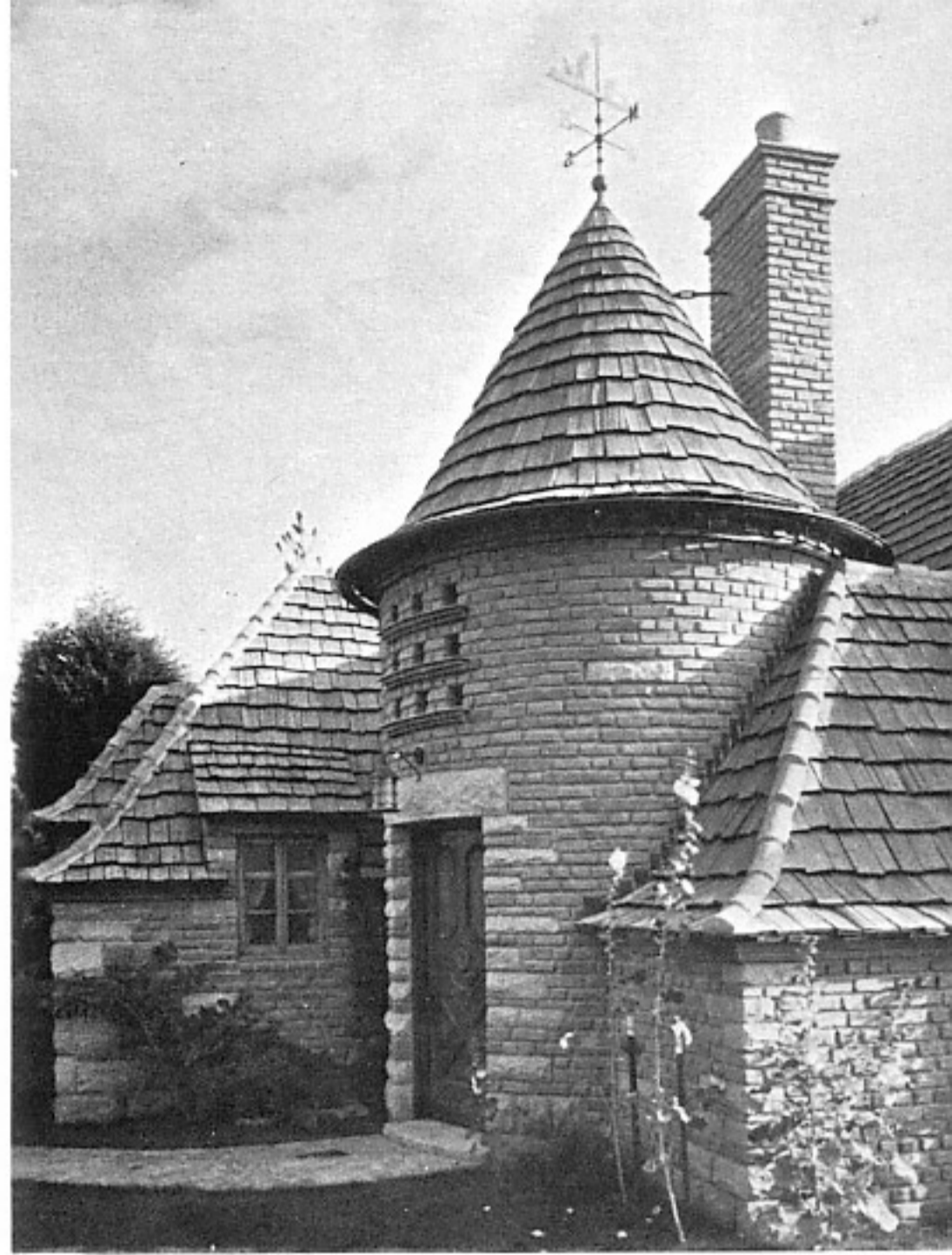
Figure 2 - Service Building, Winnett Estate (1928-29).

The Depression lessened the size and extravagance of estate commissions. Rationing and other preparations for World War II ended the era.