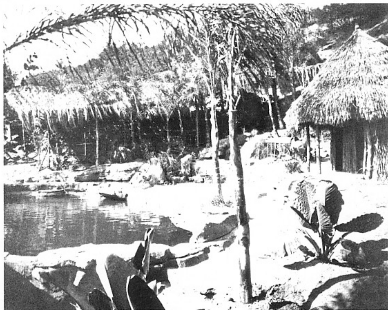
Figure 1 - Swimming Pool of "Dios Dorados," the Ince Ranch (1923).

There were few landscape architects in Southern California at the turn of the century. Not until the boom years of the teens and twenties did a sizeable number of people well trained in the field arrive and begin practice. They approached their work with both the enthusiasm of new immigrants and a sophistication which revealed their academic training in Europe or in the Northeast, under such influential figures as Andrew Jackson Downing and Frederick Law Olmsted. Together these newcomers developed an approach to landscape design which became known, not surprisingly, as the California Style.